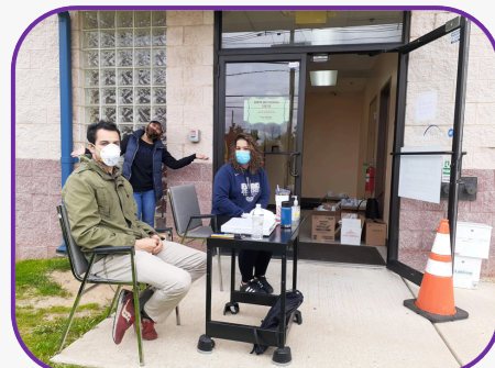
The Youth Advocate Program continued providing assistance safely during the COVID-19 pandemic.

Rutgers Against Hunger (RAH) has successfully concluded the 12th year of the Adopt-A-Family initiative. Adopt-A-Family began in 2009 as a way for the Rutgers community to support local families living near Rutgers-New Brunswick and Rutgers-Newark. We are very pleased that, as of 2020, Rutgers-Camden has joined the effort as well, broadening our reach throughout the state.