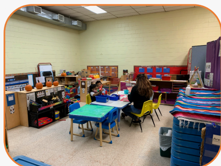
Tiny Tots Spot understands the need for education and daycare. In 2020, they taught at limited capacity to stay safe during the COVID-19 pandemic.